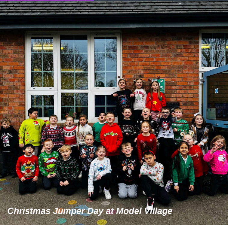
Christmas Jumper Day at Model Village